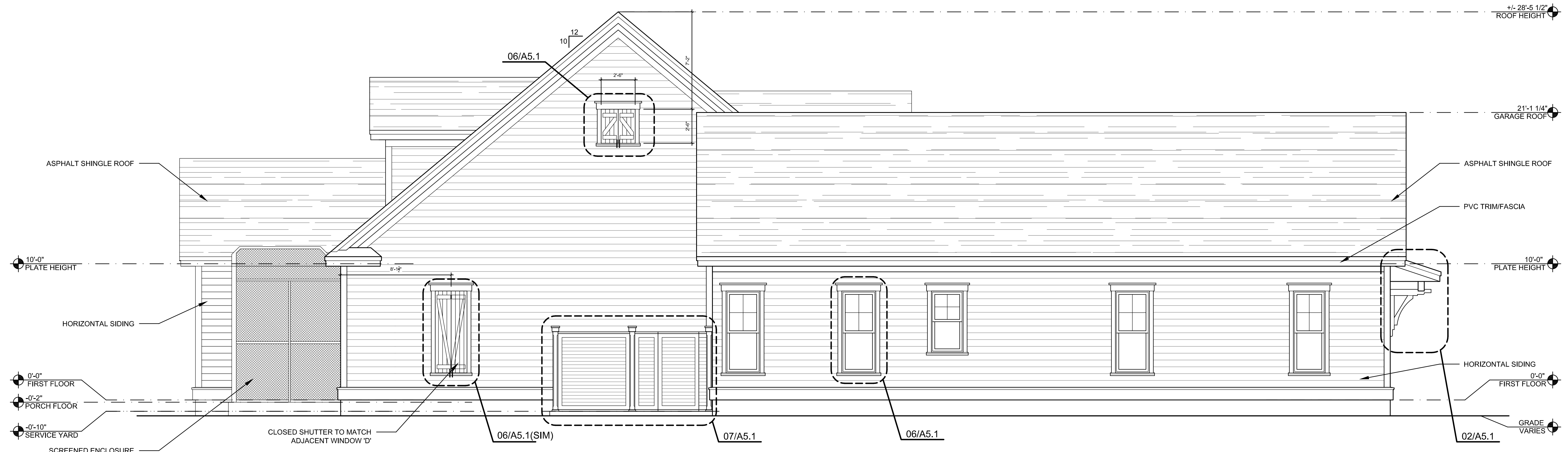
01 LEFT SIDE ELEVATION SCALE: 1/4" = 1'-0"

GENERAL NOTES: ARCHITECTURAL ELEVATION OF 0'-0" = CIVIL 21'-4" MSL. CONTRACTOR TO SUPPLY ALL LABOR, EQUIPMENT, AND MATERIALS NECESSARY TO COMPLETE ALL WORK EXCEPT AS INDICATED. ALL ITEMS DRAWN, NOTED, SCHEDULED, OR SPECIFIED, INCLUDING WORK NOT SPECIFICALLY CALLED FOR OR DRAWN, BUT THAT IS NECESSARY TO COMPLETE THE WORK, ARE PROVIDED AND INSTALLED BY THE GENERAL CONTRACTOR UNLESS SPECIFICALLY NOTED OTHERWISE. CONTRACTOR SHALL VERIFY ALL DIMENSIONS. DO NOT SCALE DRAWINGS. NOTIFY ARCHITECT OF ANY DISCREPANCIES PRIOR TO CONSTRUCTION. GC SHALL VERIFY ALL MEASUREMENTS AT SITE AND BE RESPONSIBLE FOR ACCURACY AND CORRECTIONS OF SAME.